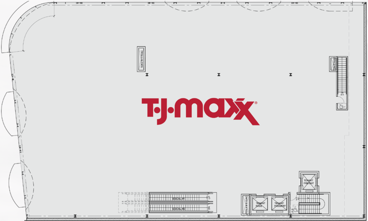
FLOOR PLAN | SECOND FLOOR