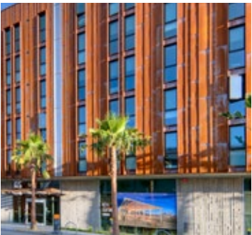
855 Brannan @ 8th St