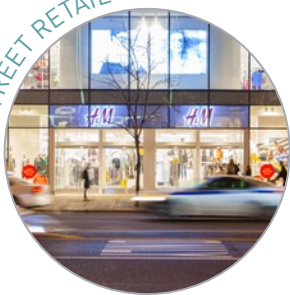
840 N MICHIGAN AVE THE GOLD COAST CHICAGO, IL